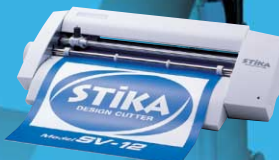
Model SV-12 250mm (12") Cutter