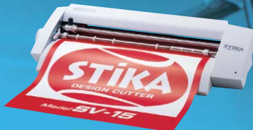
Model SV-15 340mm (15") Cutter

Create Colorful Custom Graphics with Ease