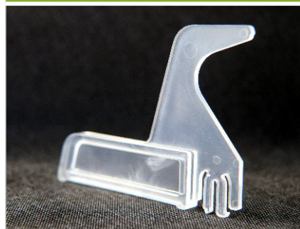
Product Code: STABS-SWAN (2/Pack)