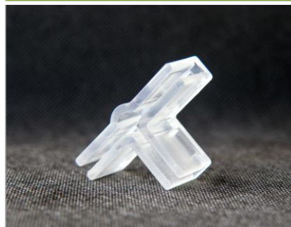
Product Code: STABS-3-3-90 (2/Pack)