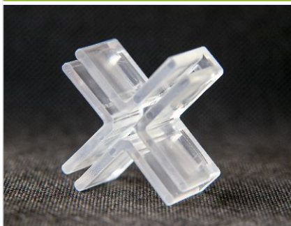
Product Code: STABS-3-4-90 (2/Pack)