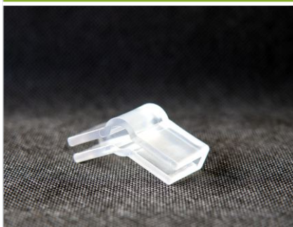
Product Code: STABS-3-2-135 (6/Pack)